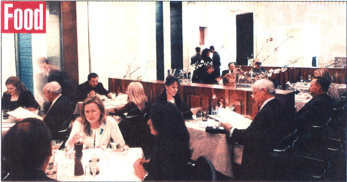
Scandinavian restaurant Aquavit has a beautiful new home on East 55th Street — and food to match from chef Marcus Samuelsson.